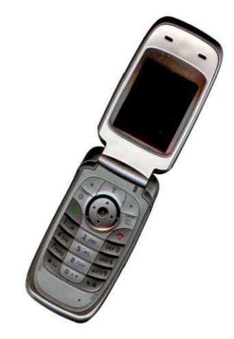
Fig. 3 Example of an image with acceptable resolution