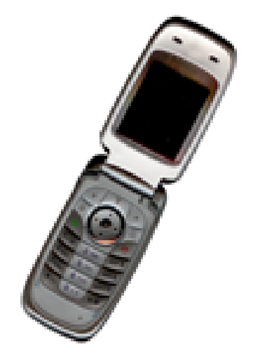
Fig. 2 Example of an unacceptable low-resolution image

Figures must be numbered using Arabic numerals. Figure captions must be in 8 pt Regular font. Captions of a single line (e.g. Fig. 2) must be centered whereas multi-line captions must be justified (e.g. Fig. 1). Captions with figure numbers must be placed after their associated figures, as shown in Fig. 1.