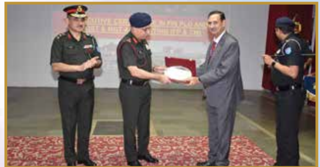
Glimpses of the Valedictory Session of the 1st batch of “Executive Certificate Course in Financial Planning and Cost & Management Accounting” conducted by ICMAI through Additional Directorate General of Army Education, Ministry of Defence for the serving officers of the Indian Army on 17th June, 2023 at AEC Training Centre, Pachmarhi, Madhya Pradesh.