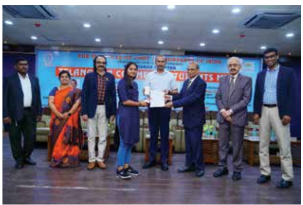
THE INSTITUTE OF COST ACCOUNTANTS OF INDIA COCHIN CHAPTER