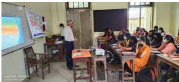
THE INSTITUTE OF COST ACCOUNTANTS OF INDIA MYSURU CHAPTER