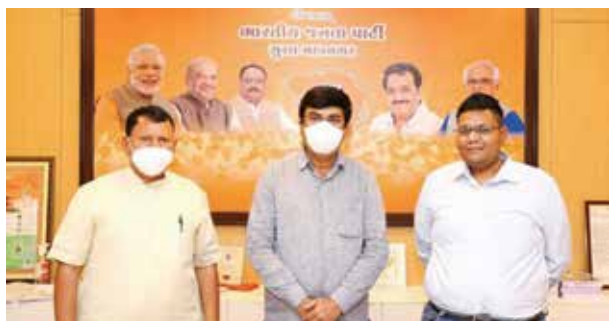
THE INSTITUTE OF COST ACCOUNTANTS OF INDIA PUNE CHAPTER