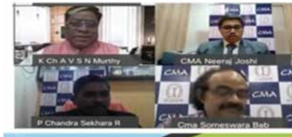
Cost Records & Audit - Practical Approach-20220...