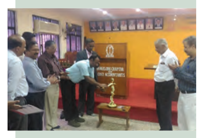
the Meet. Professional Development meets were held at different dates of August 2017at its premises and an oral coaching batch was inaugurated on August