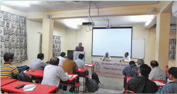
session and had explained the importance of Yoga in daily life and how it can be useful for all to reduce stress.