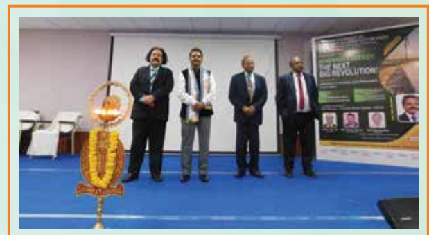
Seminar on 'Renewable Energy - The Next Big Revolution!' organized by Members in Industry & Placement Committee on 10th September 2022 at J.N. Bose Auditorium, Kolkata HQ