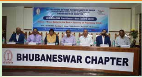
Glimpses of the All Odisha CMA Practitioners Meet organised by the Bhubaneswar Chapter of the Institute on the theme 'From Better to the Best Journey of Practicing CMAs' on 18.09.2022 at Bhubaneswar, Odisha