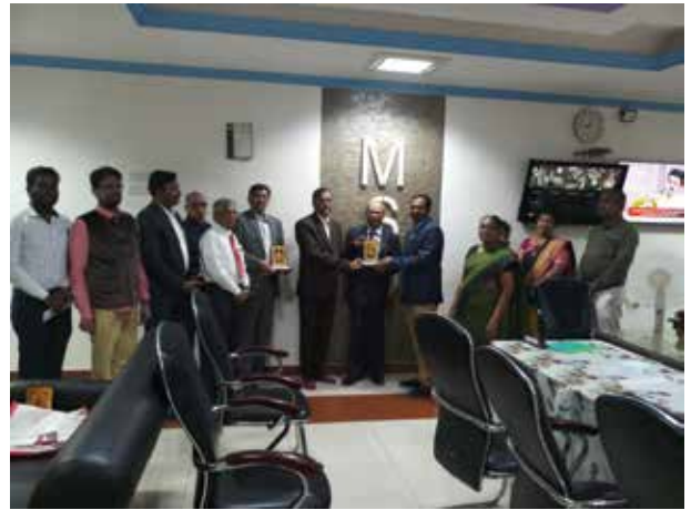
THE INSTITUTE OF COST ACCOUNTANTS OF INDIA BENGALURU CHAPTER