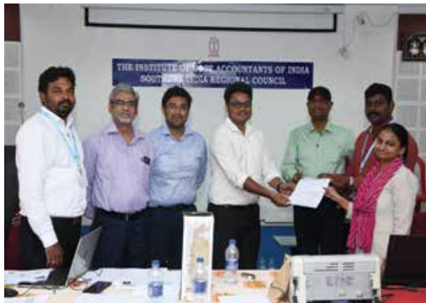
WEBINT BY ICAI-SIRC CORPORATE LAWS MONTH CELEBRATIONS on 25th Feb 2021 Topic: Nidhis - Acts & Rules and Accounting & Auditing in Nidhis