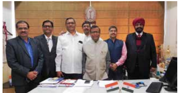
Republic Day Celebrations at the Institute Headquarters